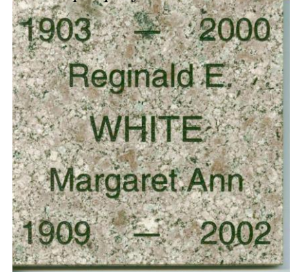
Niche plaque for a couple.